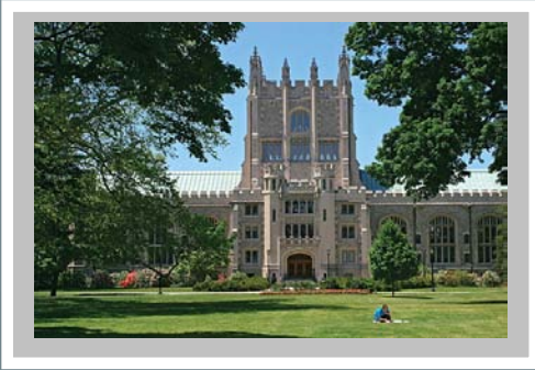
What Vassar will look like in February.